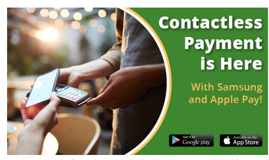
Valley Oak is proud to now offer Contactless Payment!

Click here to learn how to download the mobile app and get started!