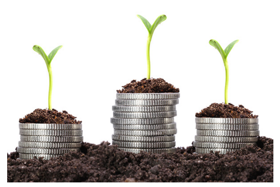
Save for the year with Valley Oak's Holiday Club!

Add funds to your Holiday Club throughout the year, and have it available for when you really need it! All funds are then available to you on November 1st, when they automatically transfer from your Holiday Club account over to your regular savings.