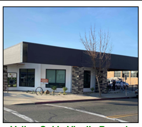
Valley Oak's Visalia Branch Remodel: Almost Complete!

on Monday, February 15th, in observance of Presidents Day.